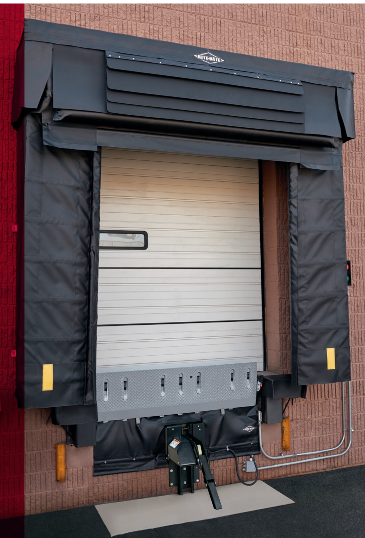
Rite-Hite® Eclipse Dock Shelter shown with PitMaster Under-leveler Seal.